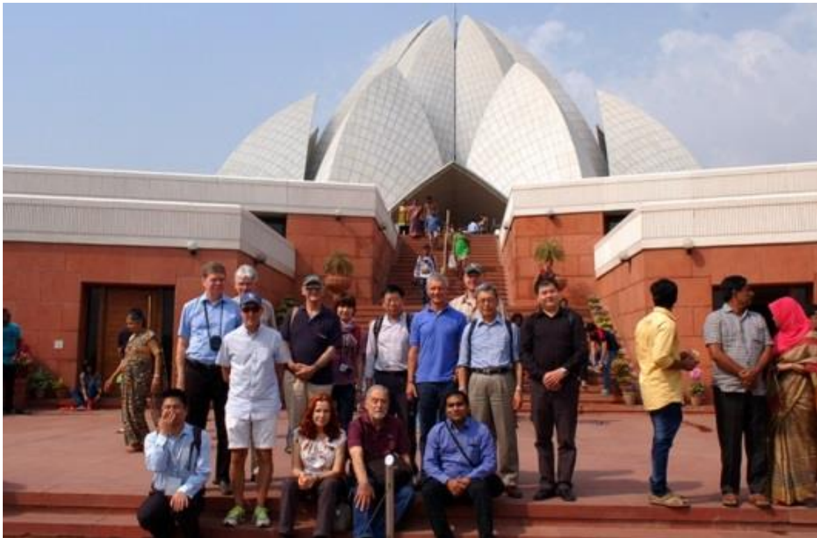
The Executive Committee visiting the Bahai Lotus Temple, open to believers of any faith.