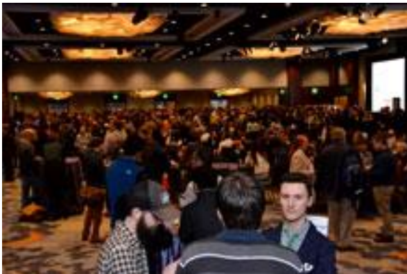
Left: AAG's International Reception connected friends and colleagues from around the globe.