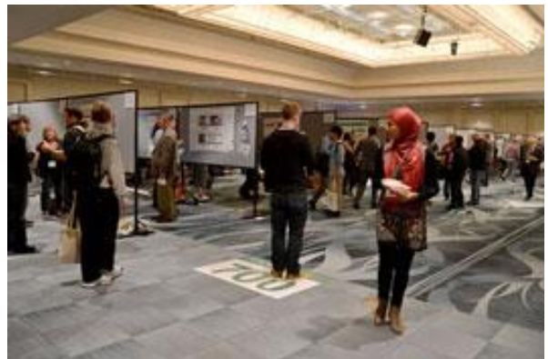
Right: Poster sessions were held during three days of the annual meeting.