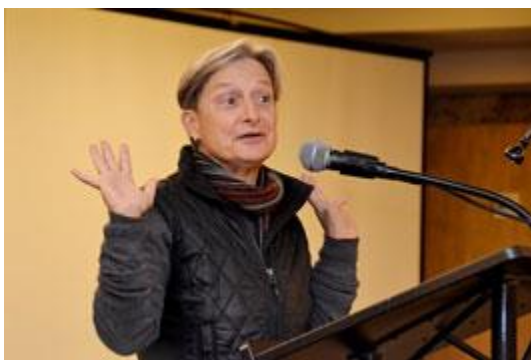
Left: AAG Honorary Geographer Judith Butler addressed a packed house and encouraged a fascinating question-and-answer with attendees.