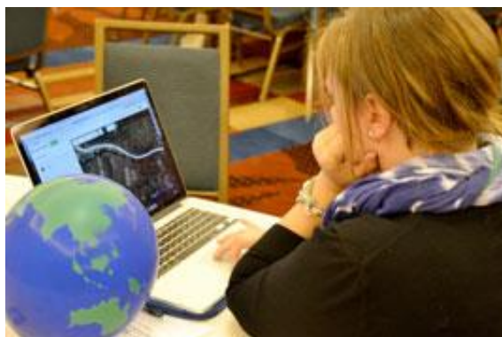
Left: A participant traces a road within OpenStreetMap's satellite imagery to contribute to the massive online effort.